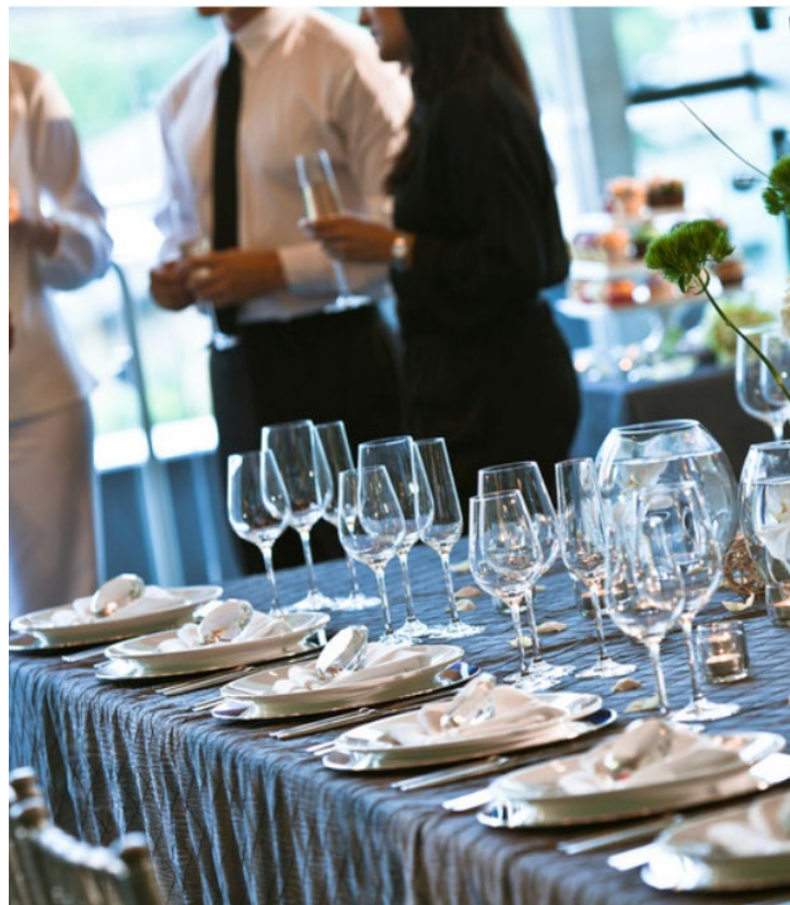
Design © TheLMent.com